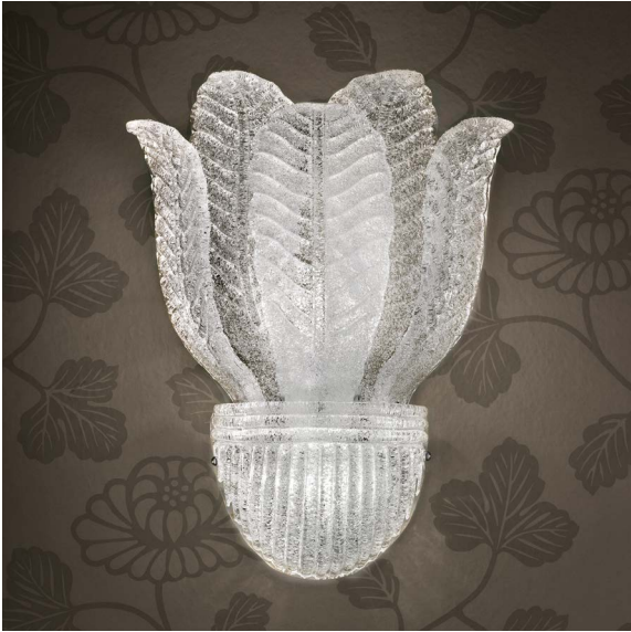
VE 1110 A1+1