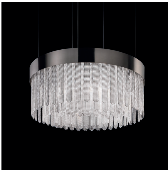
VE 1150 S12